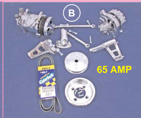
302/351 Windsor w/Short Reverse Flow Water Pump