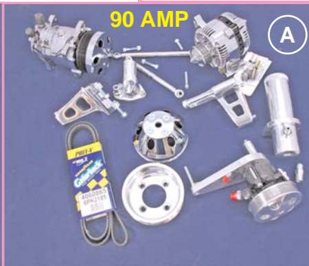
351 Windsor w/84 up Reverse Flow Water Pump & DR/PS