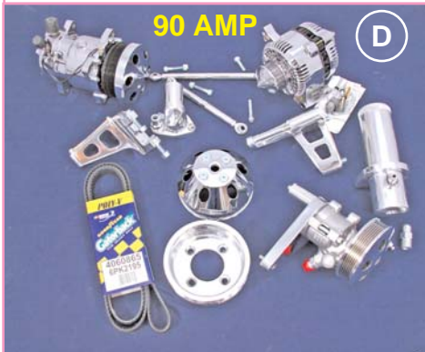
302 w/84 up Reverse Flow Water Pump & DR/PS

Drivers side Alt & Pass. Air on '84 up 302 & 351W with out fuel pump boss. Serpentine or V-Belt