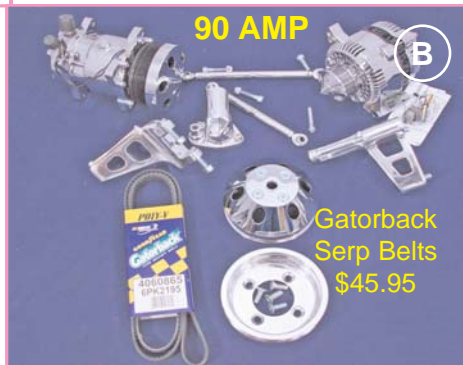
302/351 Windsor w/84 up Reverse Flow Water Pump

'84 Later have 7/16 Bolt in Driver Side Head. Ail Pass. Side have one 3/8 and two 7/16 bolts. We Must know what size bolts you have in the Drivers Side Head.