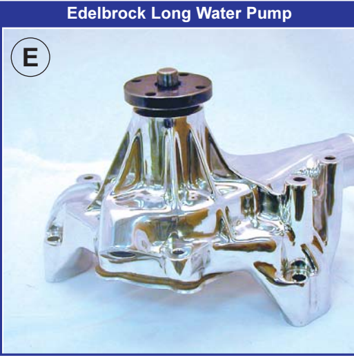
Edelbrock Long Water Pump

Alt Fan is Optional Long Water Pump w/ 2 Gr. Water Pump Pulley and 2-Gr. Crank Pulley used w/ Alternator/Air