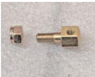
Shifter cable stud

Install shifter cable stud, 1/4X28 with 10/32 inset. Snug the stud leaving enough play to slightly swivel.