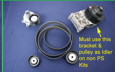
LS9 Blower Drive Without Power Steering Hardware Kit $ 1709.95

Must use this bracket & pulley as Idler on non PS Kits