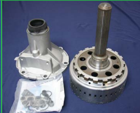
6L80E G8 Tail Housing Kit $329.95

Aluminum Power Steering Reservoir w/mounting bracket and matching Aluminum Radiator Over Flow Tank w/mounting bracket. Available Polished or Chromed. Prices on Pg. 8 or 43