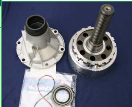
6L90E LSA Tail Housing Kit $349.95