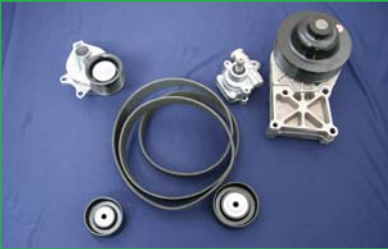
LS9 Blower Drive Power Steering Hardware Kit $1949.95