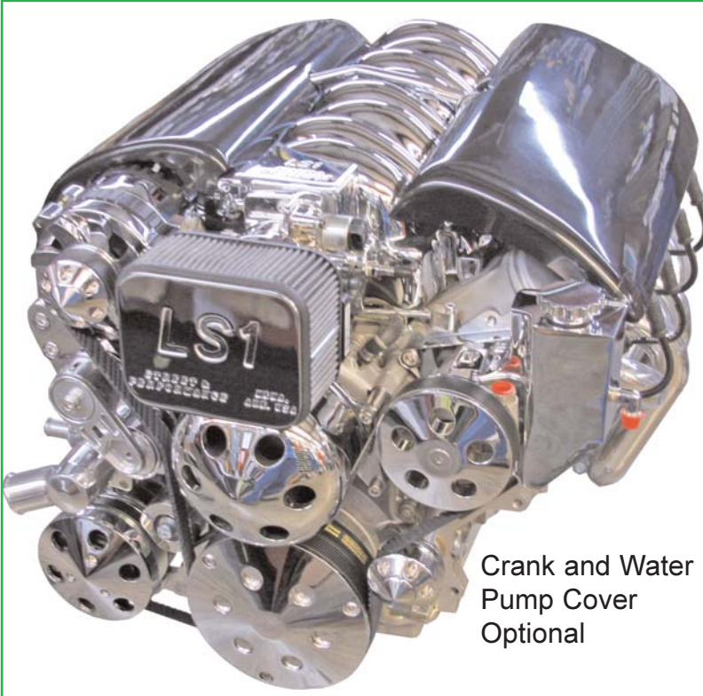
Crank and Water Pump Cover Optional